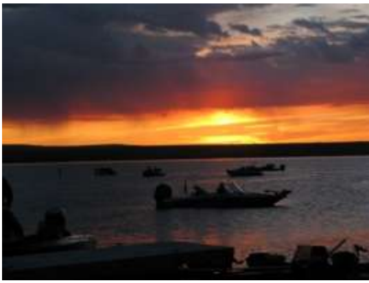
Scenes from the morning "blast-off"

Most of the pictures used in this newsletter are courtesy of Brett Prettyman. Thanks Brett!