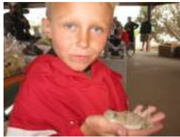
Here's what makes this event so special – Families, Fathers and Sons and Couples fishing a great event for a great cause!